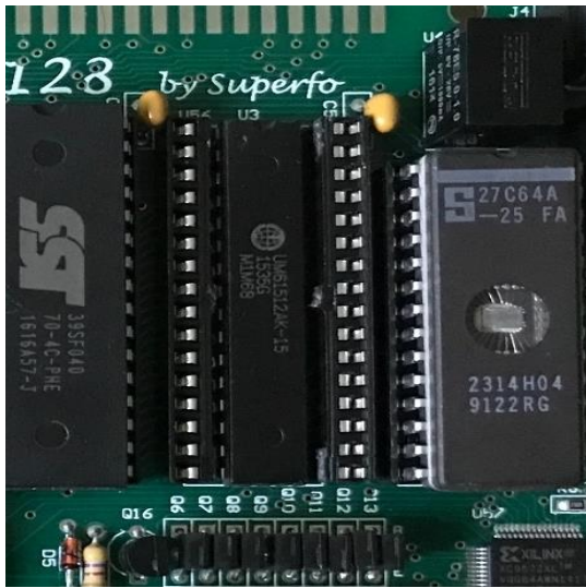
U3 (61512) is under U56 (62128)