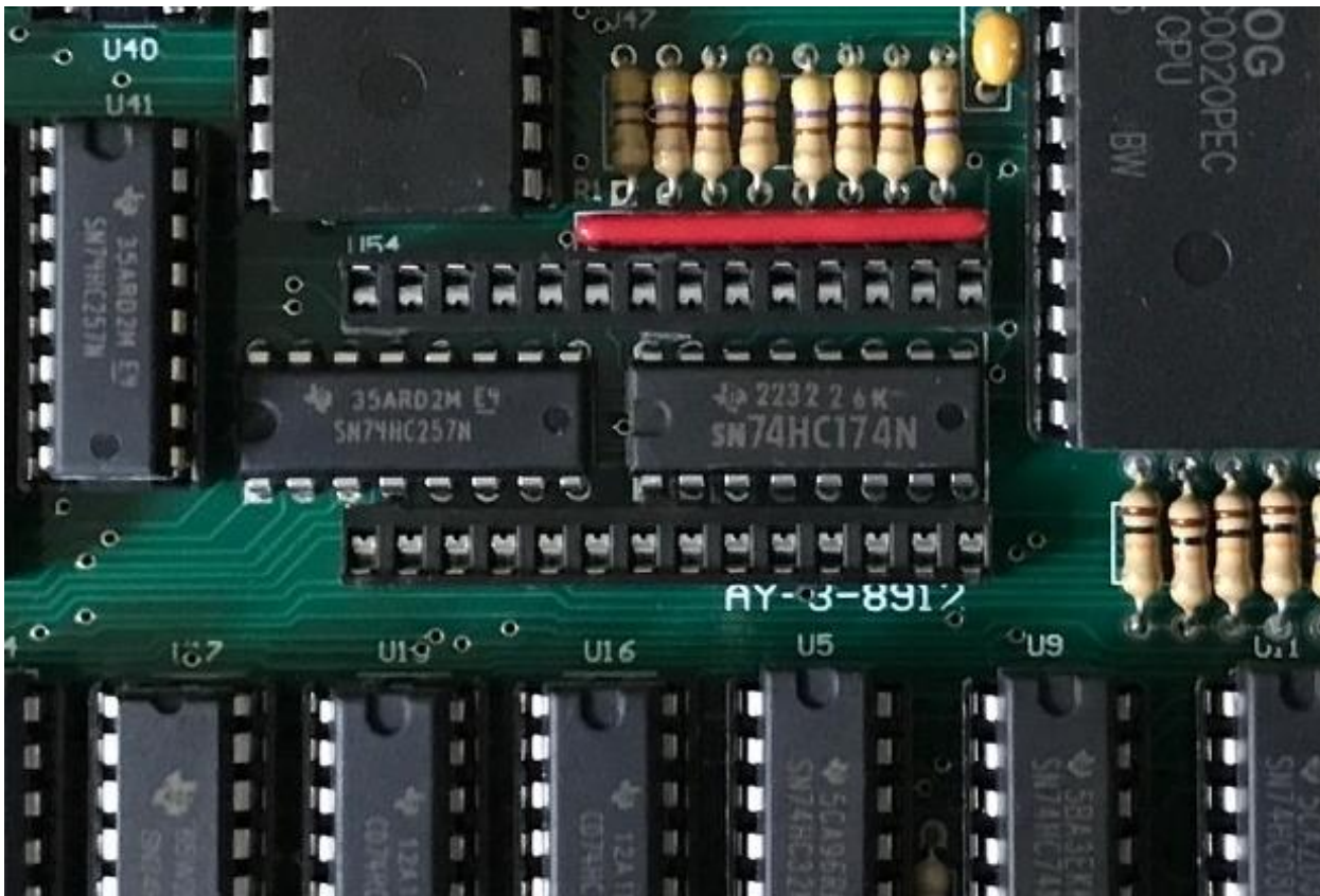
U7 (74HC174), U42 (74HC257) are under U54 (AY-3-8912)